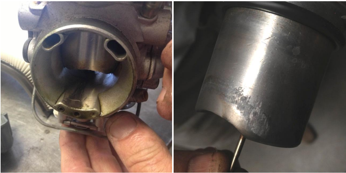
Figure 3 – Carburettor Contamination & Slide Wear