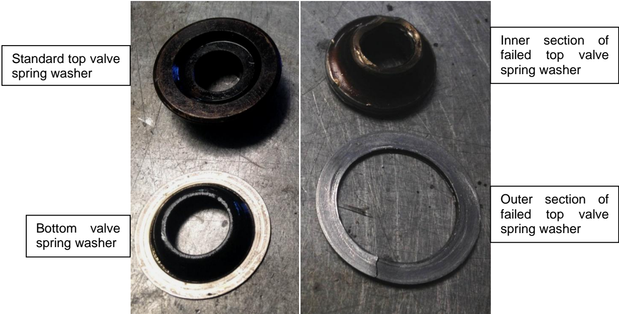
Figure 2 – Valve Spring Washers