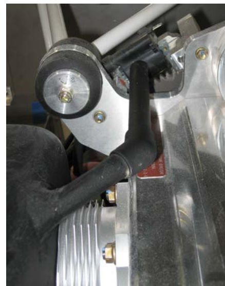
Figure 9 (duct painted black)